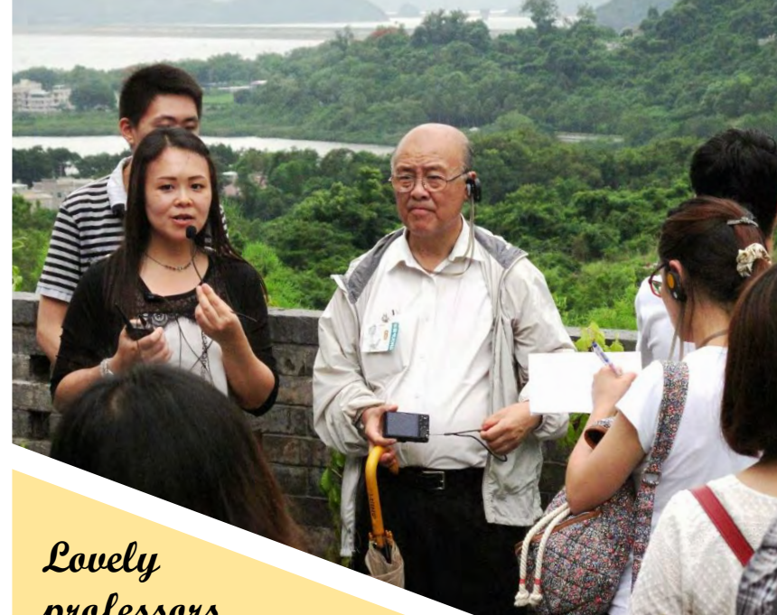
Lovely professors and classmates